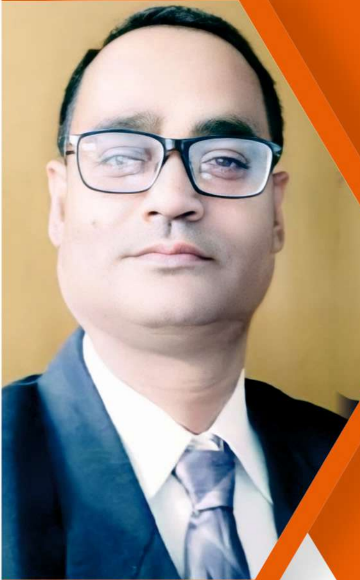
Founder & Director

The ideology and philosophy of the "VIKRAMSHILA" is originated from the Sanskrit word. "Vikramshila health and technical education council" is a global leader in skill and talent development organization. We empower you with requisite skill to enhance your employability, confident to explore new opportunities. The organization is Committed to provide the opportunity to youth of society under one roof. VHTEC is the continuous flow of Information, Knowledge, Skilling, Learning, Research and Development. Wish you all the best for beginning of a bright and prosperous future.